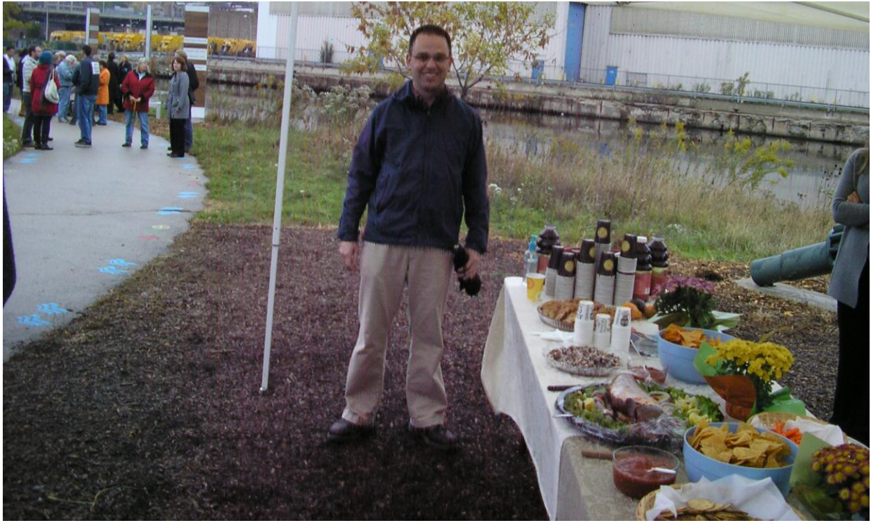
An Objibwe Blessing of the food (above). Looking west from 13 th Street Bridge [Emmber Lane](below)